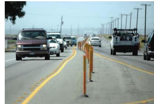
Figure 2: SR 25 in San Benito County