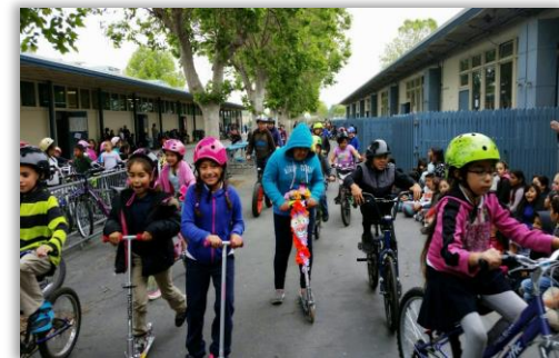
Figure 6: Bike to School Day R.O. Hardin Elementary School