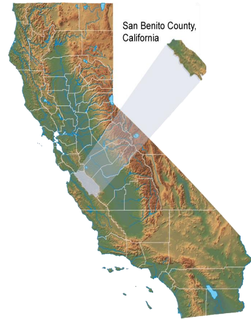
Figure 1: Map of San Benito County

The City of Hollister where the County seat is located is at an elevation of 229 feet. The north and northwest segments of the County are comprised of urban areas, leaving the southern portion of the County primarily rural.