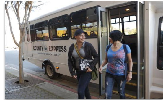
Figure 4: County Express Riders

Despite San Benito County's common perception as an auto-oriented culture, the region's transit system includes an extensive network of services and options. The San Benito County Local Transportation Authority (LTA) was formed by a Joint Powers Agreement between the City of Hollister, City of San Juan Bautista, and the County of San Benito in 1990. The LTA is responsible for the administration and operation of the County Express and Specialized Transportation public transportation services in the San Benito region (Figure 4: County Express Riders).