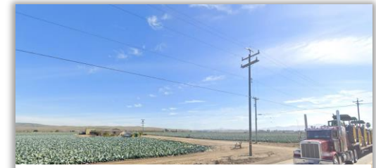
Figure 3: SR 156 between Hollister and San Juan Bautista

The San Benito region also provides an extensive public transit service for residents.