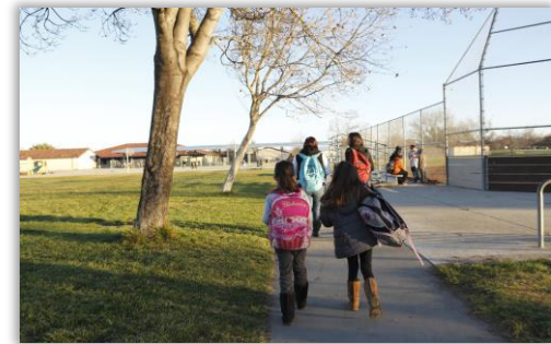
Figure 5: Walk to School Day Calaveras Elementary School