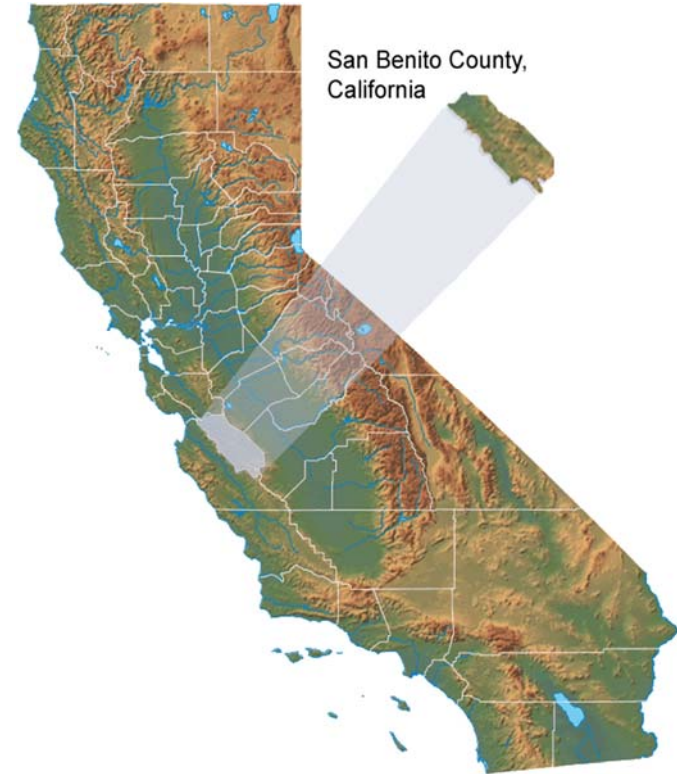
Map of San Benito County

The County has two incorporated cities – Hollister, population 35,000, and San Juan Bautista, population 1,700 – and various unincorporated communities (Aromas, Tres Pinos, Panoche, Ridgemark, and Paicines). Major transportation routes bisecting the County include State Routes 129, 156, 25 and U.S. 101.