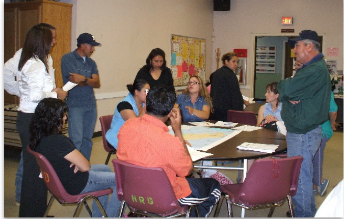
Figure 7-1: Workshop at Hollister Community Center

Providing opportunities for public participation in the Regional Transportation Plan is important to the Council of San Benito County Governments (COG). Early and frequent public involvement is essential to ensuring that the community gains a clear understanding of COG's role as the Regional Transportation Planning Agency for San Benito County. Furthermore, public involvement helps the COG policymakers, staff, and partner agencies