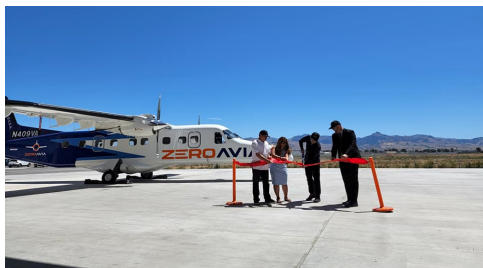
COG as the San Benito Airport Land Use Commission (ALUC) attended the opening of the City of Hollister Municipal Airport's first through-the-fence access project.