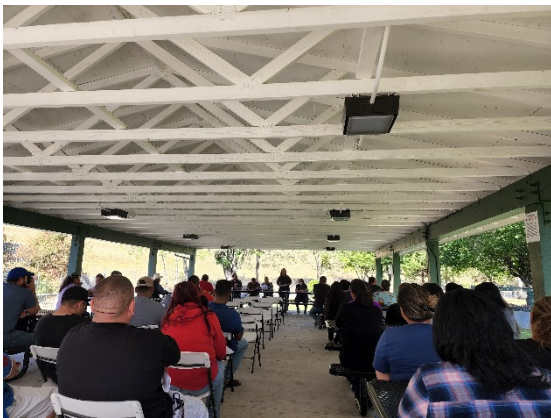
COG presents to local labor camp residents about public transportation consistent with the Human Services Transportation Plan.