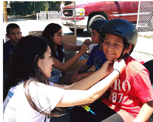
COG participation in the annual Kids at the Park event by conducting helmet fittings.