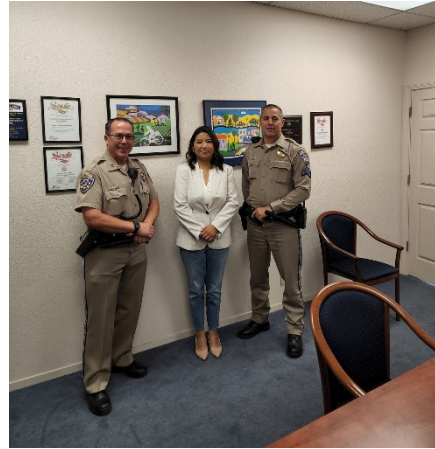
CHP joined COG in a discussion about community safety on the regional highway system.