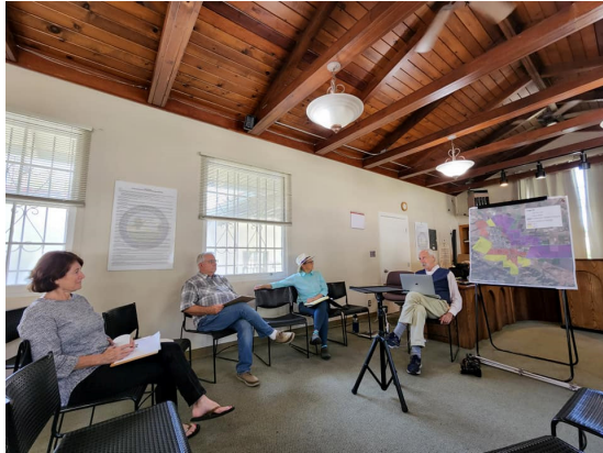
COG joined the City of San Juan Bautista on a community-wide discussion on mobility and transportation.