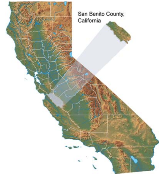
Map of San Benito County

The County has two incorporated cities – Hollister, population 35,000, and San Juan Bautista, population 1,700 – and various unincorporated communities (Aromas, Tres Pinos, Panoche, Ridgemark, and Paicines). Major transportation routes bisecting the County include State Routes 129, 156, 25 and U.S. 101.