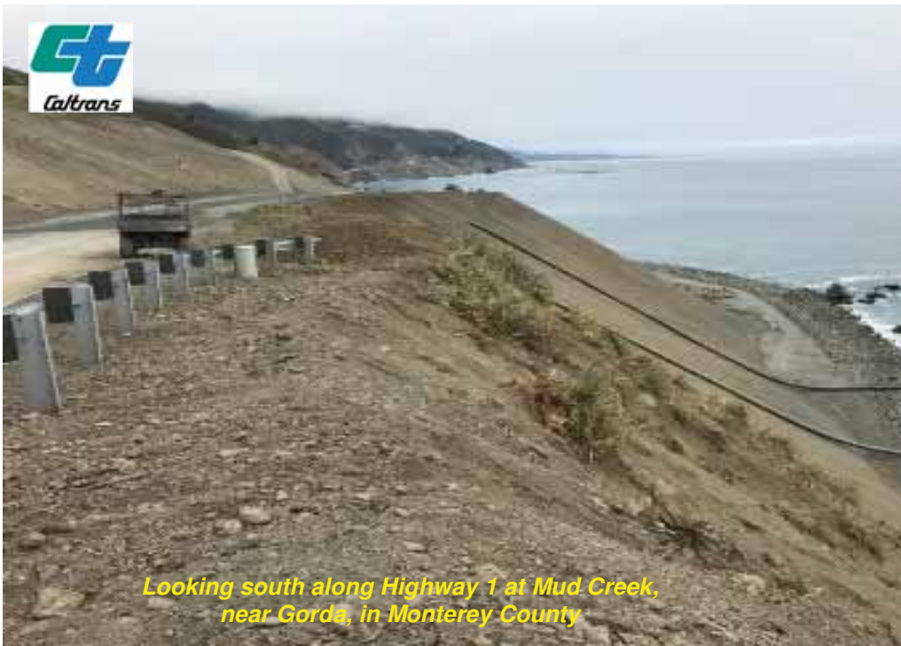
Looking south along Highway 1 at Mud Creek, near Gorda, in Monterey County