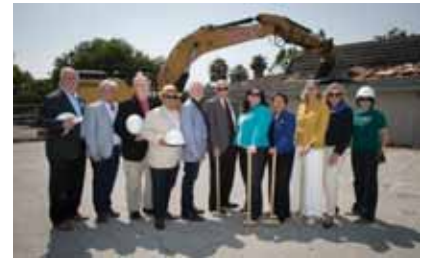
Local partners celebrate rail extension