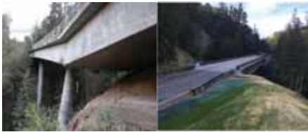
Highway 1 Pfeiffer Canyon Bridge (before/after)