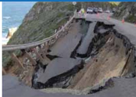
Highway 1 near Carmel in Monterey County

Adaptation efforts enhance the transportation system's resiliency to help protect against climate impacts. Eligible projects include roads, railways, bikeways, trails, bridges, ports and airports. The sustainable grant program supports climate change adaptation on the transportation system, especially in communities most vulnerable to impacts. More information: http://www.dot.ca.gov/hq/tpp/grants.html