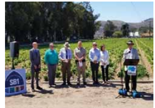
Caltrans and partners celebrate project's completion Highway 246 Passing Lanes Completed

Statewide, Caltrans is committed to fixing more than 17,000 lane miles of pavement, 500 bridges, 55,000 culverts, and 7,700 traffic operating systems. More information: http://rebuildingca.gov/