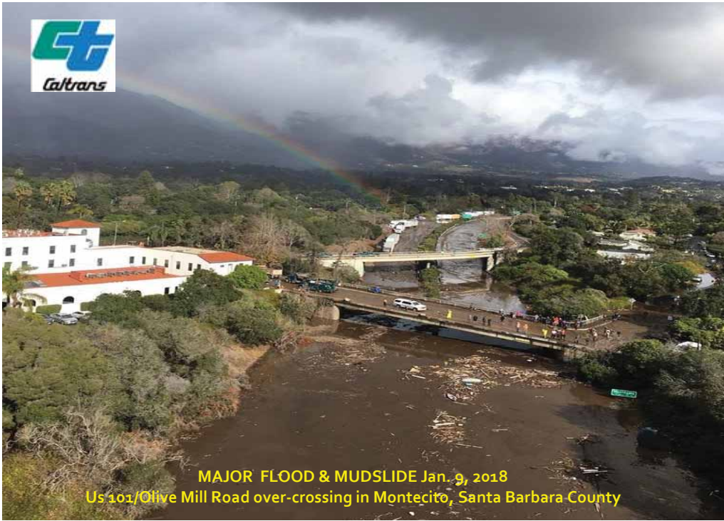
MAJOR FLOOD & MUDSLIDE Jan. 9, 2018 US 101/Olive Mill Road over-crossing in Montecito, Santa Barbara County